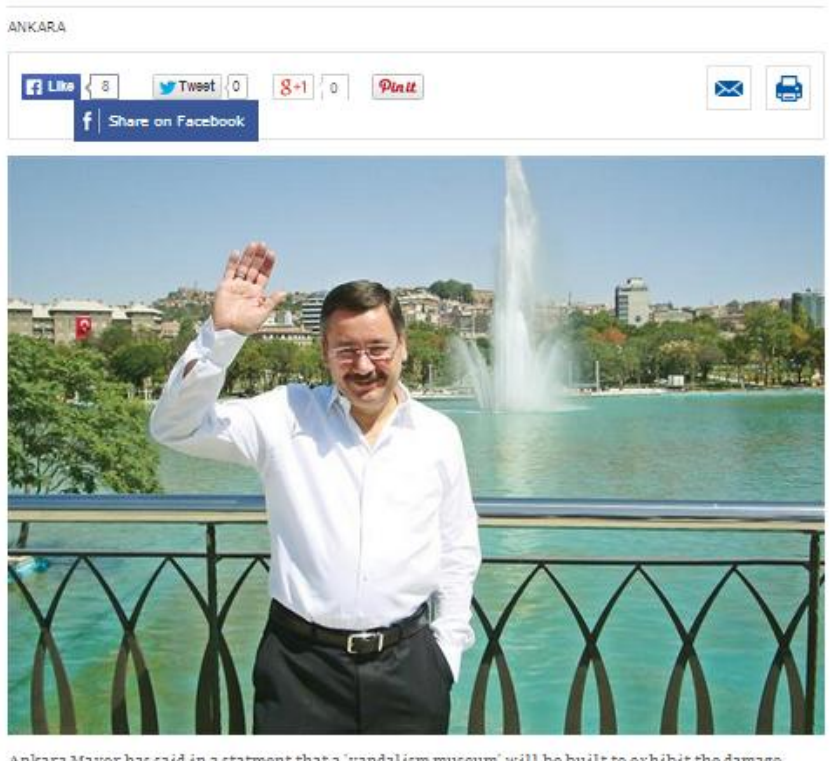
Ankara Mayor has said in a statment that a 'vandalism museum' will be built to exhibit the damage caused to public property by Gezi protesters.